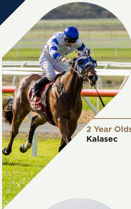
2 Year Olds Kalasec