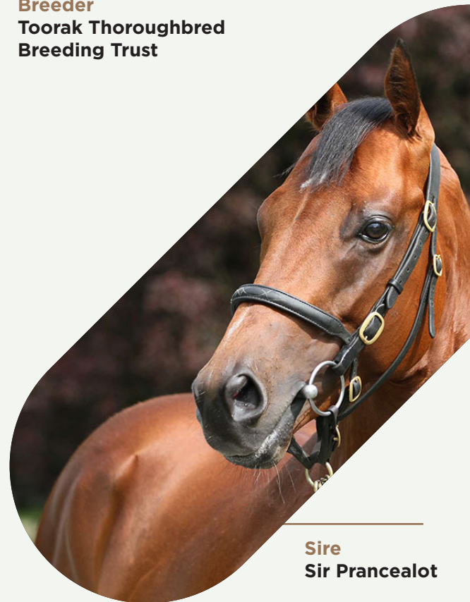
Sire Sir Prancealot