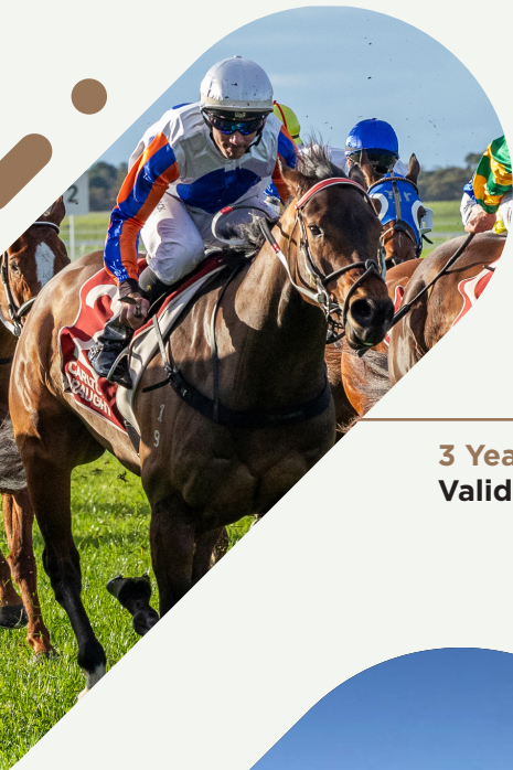
3 Year Olds Validated

Racing Rewards SA Premiership 2022/2023: