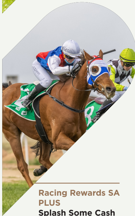
Racing Rewards SA PLUS Splash Some Cash