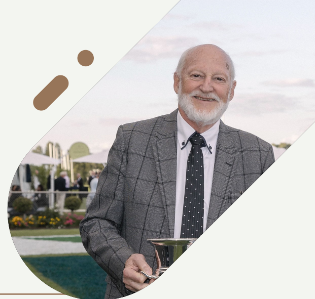
Breeder Toorak Thoroughbred Breeding Trust