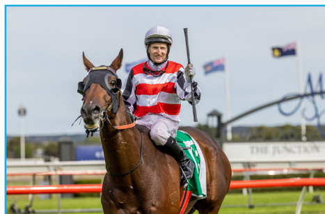
REBEL RACER / CRAIG NEWITT WINNER OF THE 2023 ADELAIDE CUP