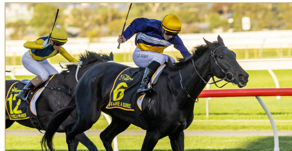
AFFAIRE A SUIVRE / JOHN ALLEN WINNER OF THE 2023 AUSTRALASIAN OAKS